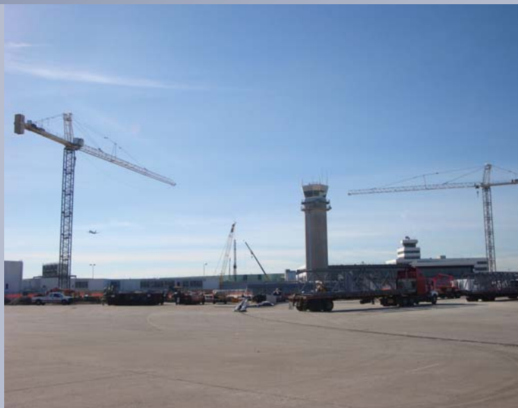
Dallas, TX – Southwest Airlines Terminal expansion; 12-14 month project