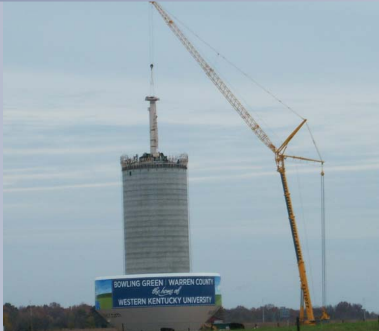
Bowling Green, KY – Elliott AmQuip setting a water tank using a 360 Ton AT.