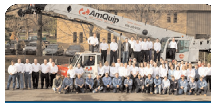
AmQuip - Corporate Headquarters, Bensalem, PA