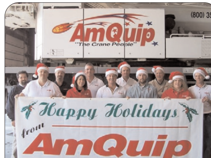
Congratulations to our Ohio Branch celebrating October as a record breaking month.