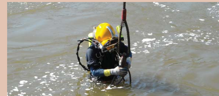
Miller Waste Water Treatment Plant; Trenton, OH