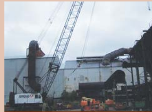
A 150 ton crawler at Newport Steel for Hosea Worldwide Movers